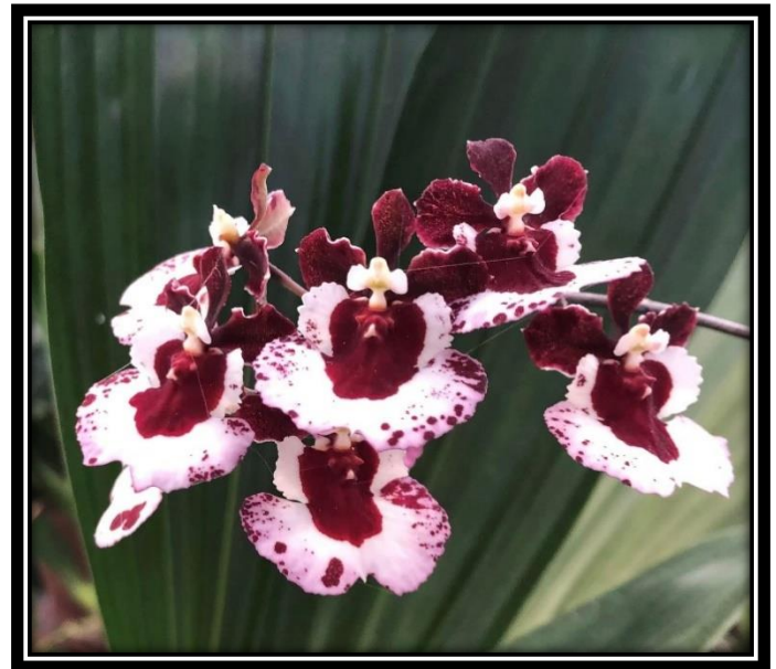
Tolumnia Bravo 'Nalo Beauty'