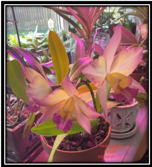
Iwanagara Apple Blossom 'C'