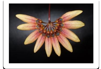
Bulb. sibuyanense