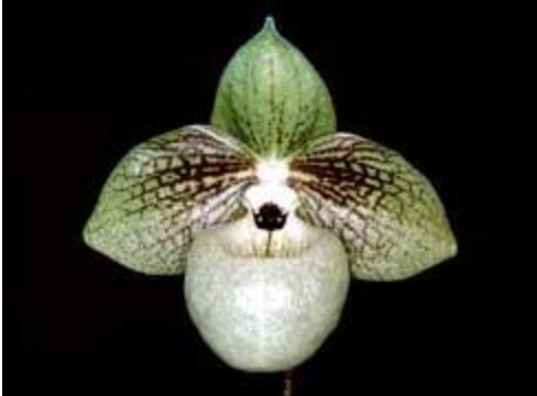
Paphiopedilum malipoense 'San Leandro' HCC/AOS - exhib: Fred D. Jernigan

While a very adaptable species in cultivation, the key to best flowering is a rather cool winter rest. In its native habitat, summer days average 80° F or higher and humidity and rainfall are very high. This is followed by a sharply cooler and drier winter with days averaging about 60° F (15° C). Nights can easily drop to 32° F (0° C) or even a degree or two below freezing. Winters in this part of the world are typically very dry and often the only moisture available to the plants is in the form of nightly mists that form on the hills and forests.