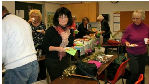
Members enjoy the refreshments